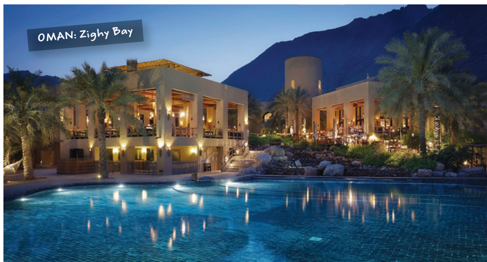
OMAN: Zighy Bay