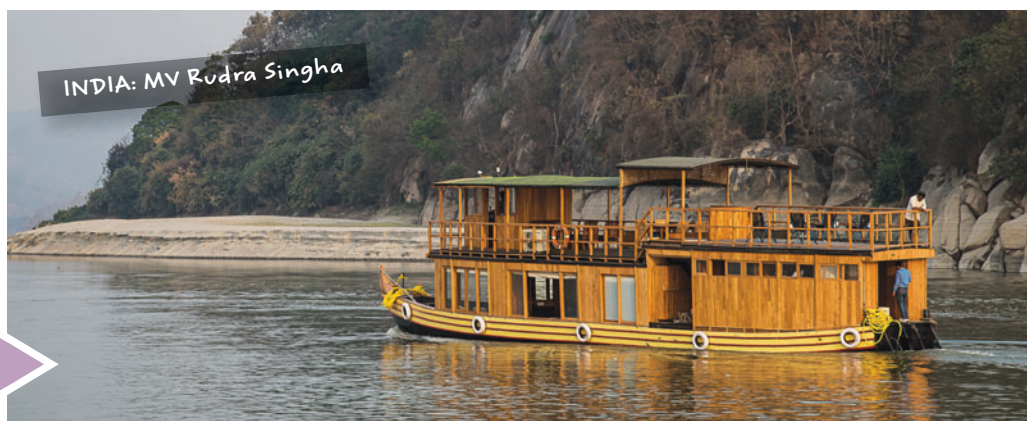
INDIA: MV Rudra Singha

» inspire me « Work with me to custom build your very own private river cruise this coming winter. The MV Rudra Singha is an air-conditioned wooden houseboat staffed by captain, chef and guide/naturalist. Enjoy village walks, wildlife safaris, cycling (two bikes on board), tea-tasting, local culture and markets, cooking and weaving classes, textile villages and fishing.