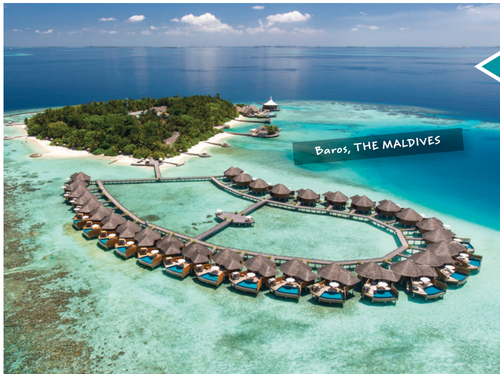
Baros, THE MALDIVES