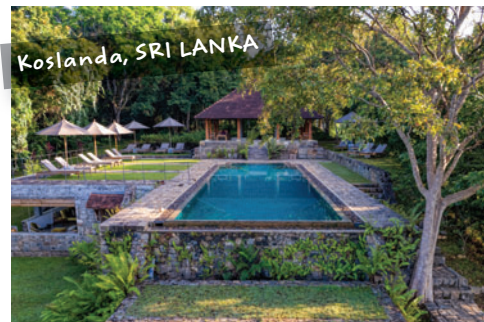
Koslanda, SRI LANKA

» inspire me « Charter your own seaplane. Fly over the garland of islands to spot whale sharks and manta rays. Land on a beach to relax or go surfing. Try award-winning boutique resort Baros or 5 star Anantara Dhigu , great for families. 110 beach villas and over water suites with spa, surf school and PADI freediving as well as free boat to two sister resorts and small desert island Gulhifushi . For couples try COMO Cocoa Island a secluded, private island with 33 overwater villas. Understated luxury focussed on holistic wellness.